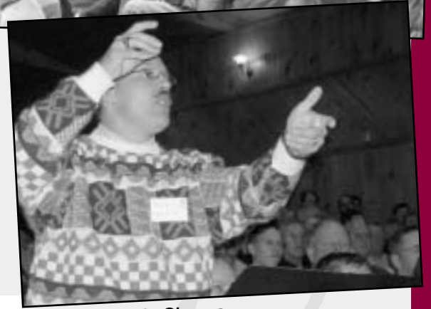
Leading Men's Chorus