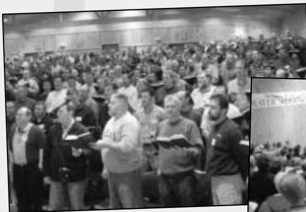
Men's Prayer Advance