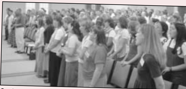
Student Prayer Advance Virginia

The messages from both Advances are available on compact discs from our office. You may contact us for information on obtaining these sermons.