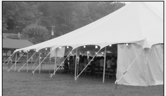
The "Big Tent" in Virginia — YPA