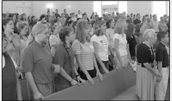
YPA — South at Ambassador Baptist College, NC

May God's people not forget, but seek to advance in their strivings in prayer that this next generation would indeed know and walk with their God. Epaphras was a powerful prayer laborer, of whom it was said in Col. 4:12 that he was "always laboring fervently for you in prayers, that ye may stand perfect and complete in all the will of God." We need to have that same striving of Epaphras in prayer for our young people, that the stirrings of their hearts during the Prayer Advance would not quickly fade away, but indeed produce fruit that abides. The future generation in America desperately needs godly, sober-minded young servants of Christ to be raised up in our midst. Our hope is that it will begin with many of those that attended this Youth Prayer Advance.