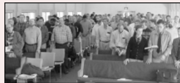
The Men's Prayer Advance South at Georgia Baptist Conference Center in Toccoa.

"God has cleansed me. I was bitter for many years and lost my joy. I finally realized why. I