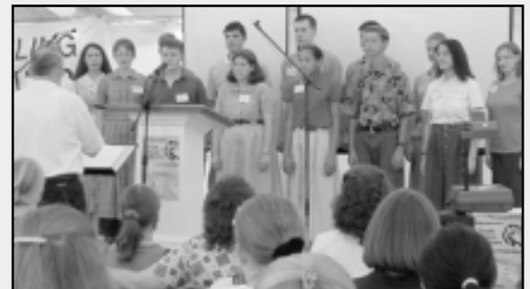
The Chorale from Georgia singing at the Youth Prayer Advance in Montebello, Virginia at Camp Blue Ridge.