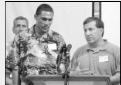
A powerful testimony from one of our foreign attendees at the Youth Prayer Advance.