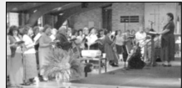
The Ladies' Prayer Advance in Virginia, coming to a new location in 2003 at the Smith Mountain Lake 4-H Camp.