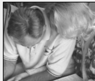
A sweet time of prayer at the Couples' Prayer Advance in West Virginia at Canaan Valley Resort.