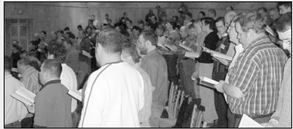
The Virginia Men's Prayer Advance in Goshen at Rockbridge Alum Springs Young Life Camp.